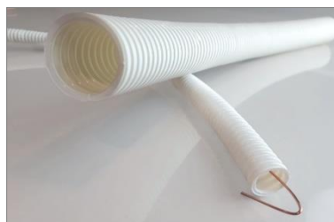
Photo. 1 RKLGHF of PC/ABS 320 N without and with guide wire